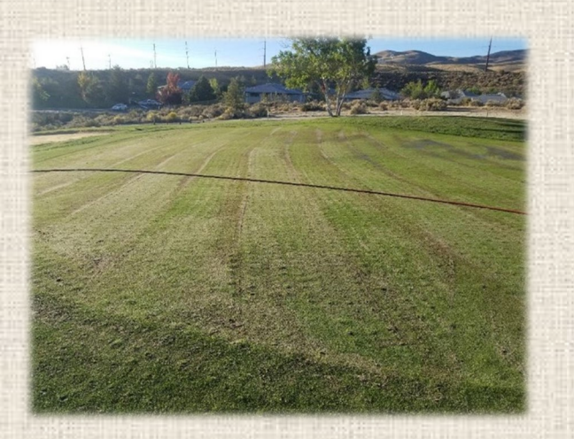
After DryJect was completed