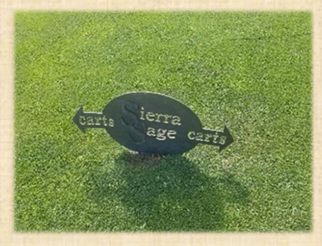
New Course Signage. $3,000