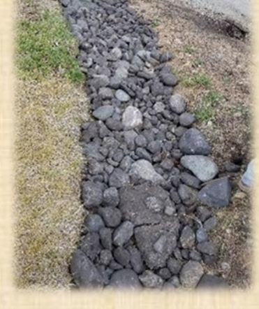
Drainage updated on course $7,000