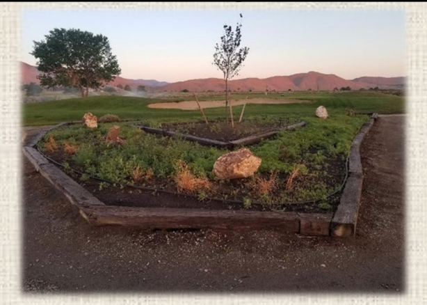
Butterfly Garden with Drip System $5,000