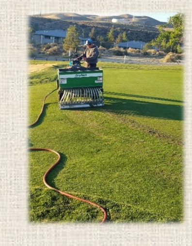
DryJect Completed. $15,000