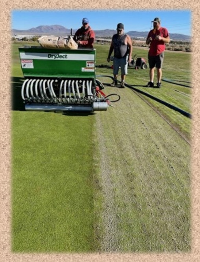
DryJect performed $15,000