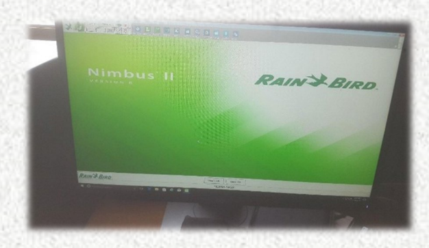
Part of irrigation upgrade