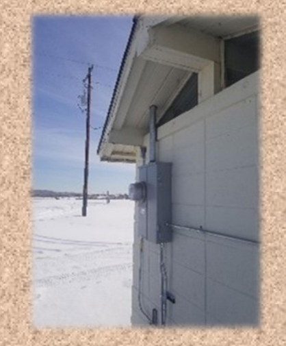
Remodel of bathrooms on holes 2 and 17. $90,000