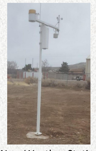
New Weather Station