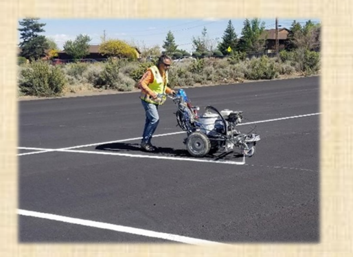
Parking lot repaired, resealed and repainted $65,000