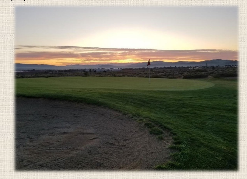
Before and after new sand in Bunkers $65.000