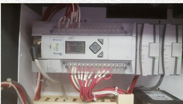
Irrigation included a $39,000 computer software upgrade