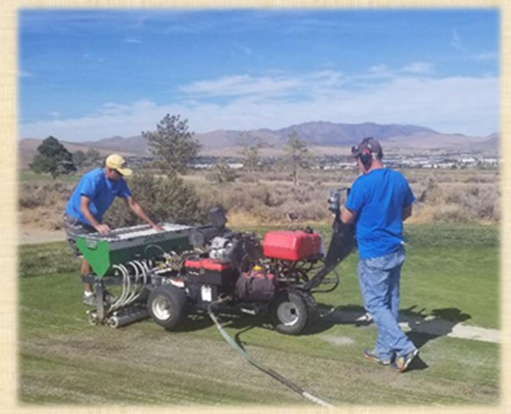
DryJect Completed $15,000