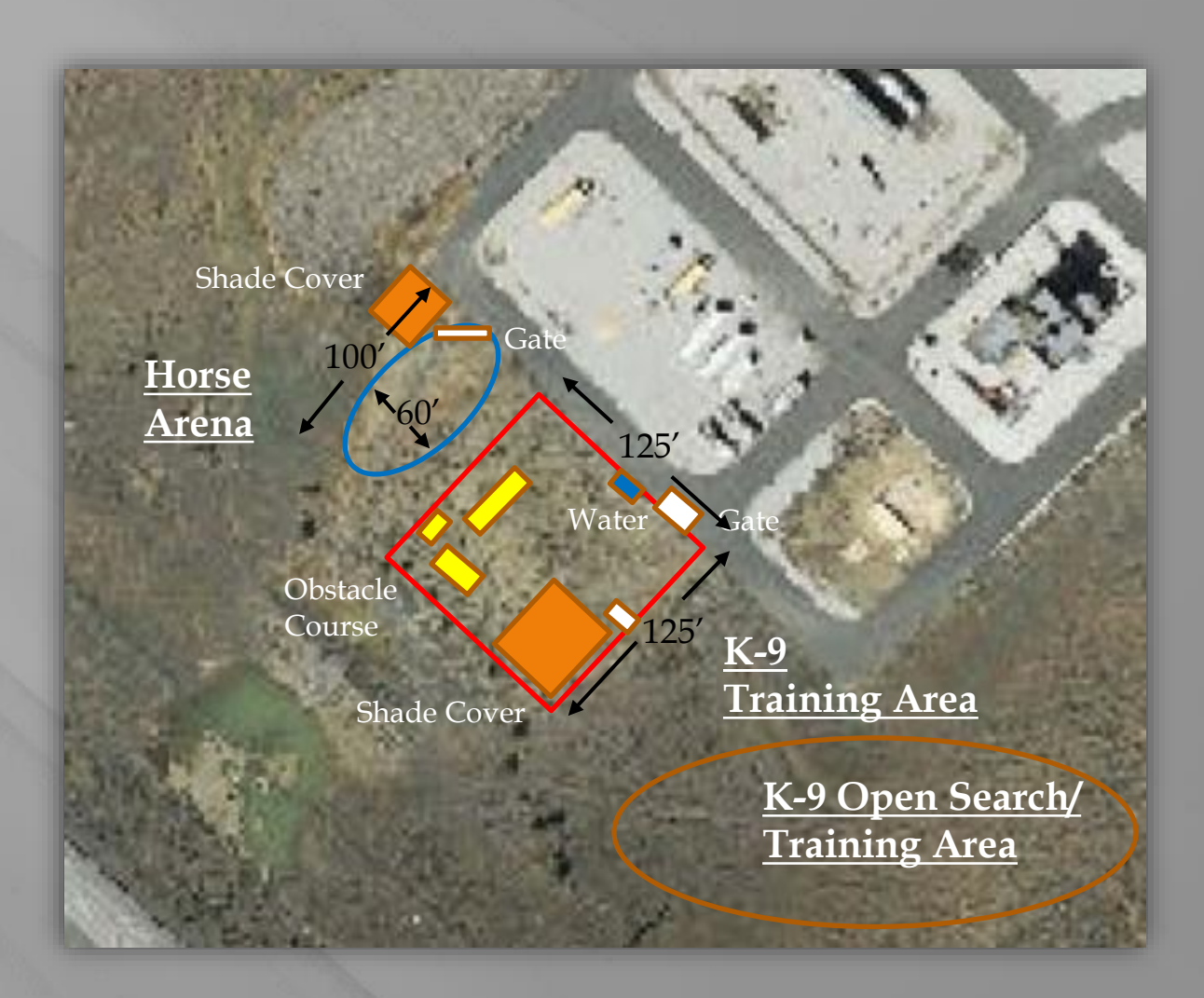
K-9 Training Park & Mounted Unit Staging Area