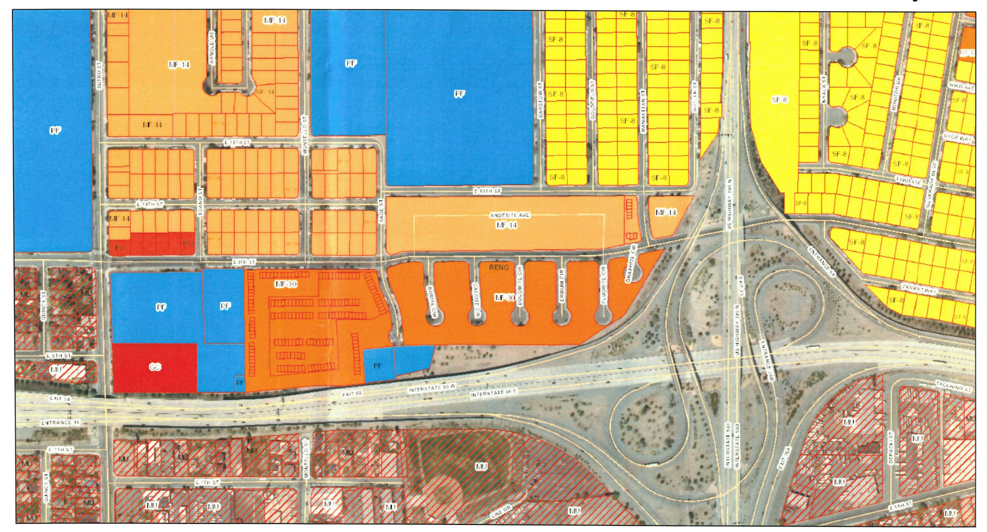
May 6, 2021