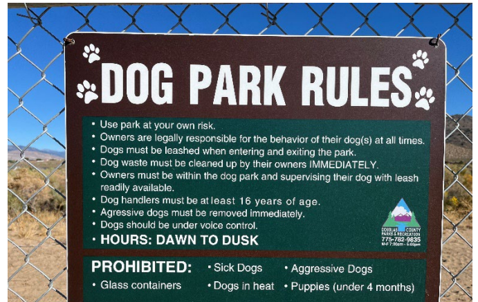
Johnson Lane Dog Park in Douglas County

RE: Whites Creek Park Off-Leash Dog Park?